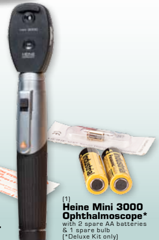
(1) Heine Mini 3000 Ophthalmoscope* with 2 spare AA batteries & 1 spare bulb (*Deluxe Kit only)