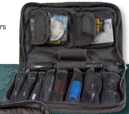
Basic Kit ▲