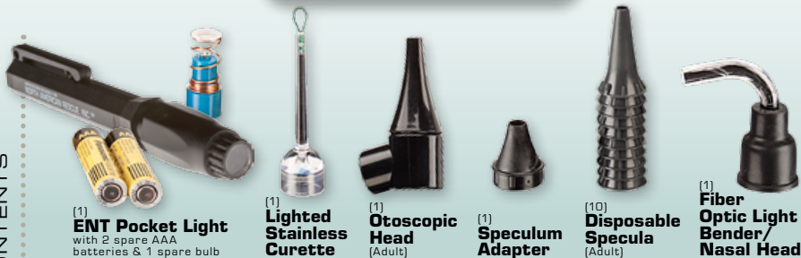
(1) ENT Pocket Light with 2 spare AAA batteries & 1 spare bulb